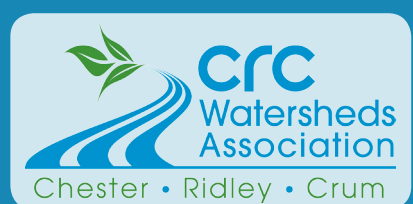
Illustration: Holly Harper